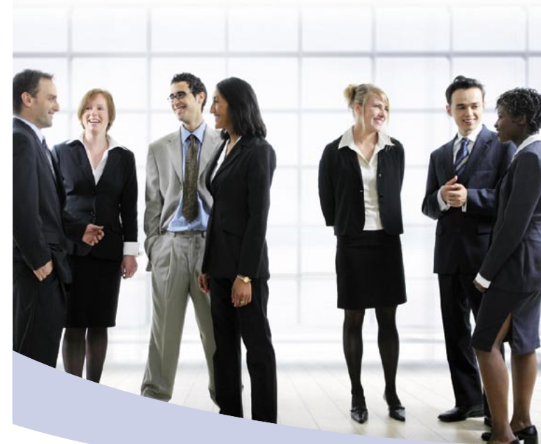
Joint Conference by the World Health Organization and the German Alliance for Mental Health Co-organized by the European Commission and supported by the German Federal Ministry of Health

Co-organized by the European Commission and supported by the German Federal Ministry of Health